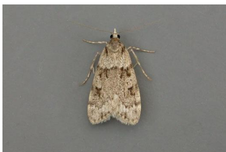
1335 Scoparia ancipitella

1335 Scoparia ancipitella – Kielder (5, 67) 14.viii.2011 – TJT & KD