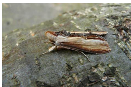
2221 Mullein Shargacucullia verbasci