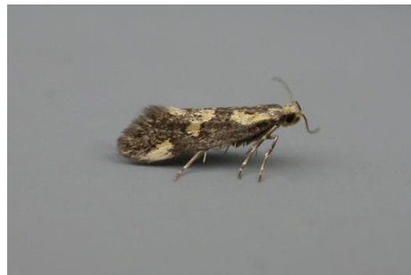
0636 Denisia similella

0636 Denisia similella – Swarland (3, 68 ) 8.viii.2011 – AJF