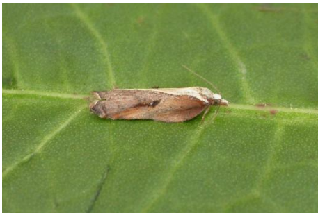
1054 Acleris cristana

1054 Acleris cristana – Eshott (4, 67) 15.iv.2011 – MSH