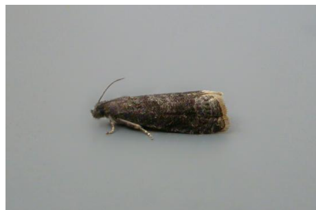
1247 Grapholita funebrana

1247 Plum Fruit Moth Grapholita funebrana – Whitley Bay ( 67 ) 3.viii.2011 – TCS