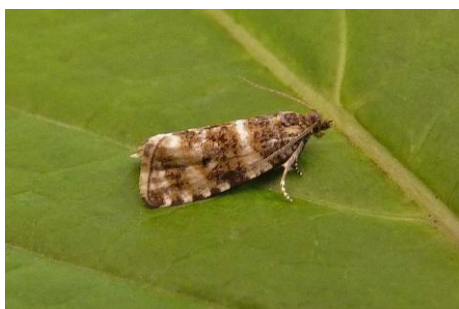
1075 Olethreutes micana

1075 Olethreutes micana – Newham Bog (5, 68) 13.vii.2011 – AJF