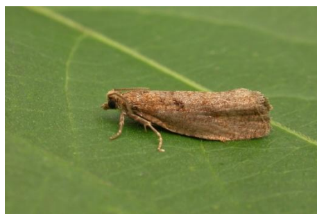
1153 Epinotia sordidana

1153 Epinotia sordidana – Tynemouth (5, 67) 4.x.2011 – TJT