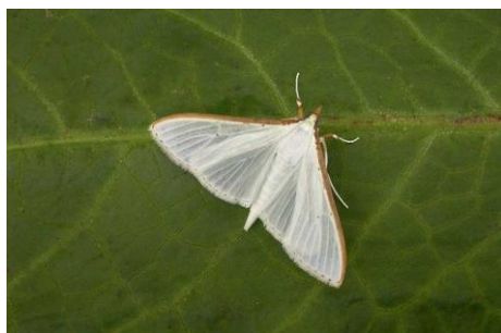
1408 Palpita vitrealis 1452

1408 Palpita vitrealis – Tynemouth (67) 27.ix.2011 – TJT, the 2 nd vc67 record, the last being on 24.ix.1956 at Riding Mill (67)