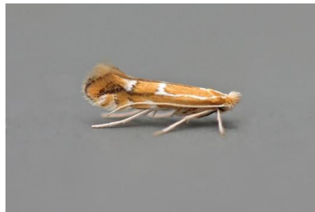
0332a Phyllonorycter leucographella

0332a Phyllonorycter leucographella – Swarland (38, 68 ) 18.x.2011 – AJF