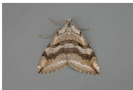
1868 Lesser Treble-bar Aplocera efformata