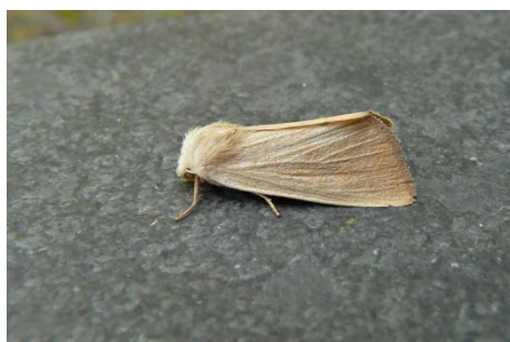
2377 Fen Wainscot Arenostola phragmitidis

2377 Fen Wainscot Arenostola phragmitidis – Howick (2, 68 ) 12.viii.2011 – SS