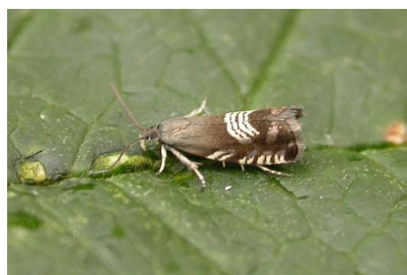
1241 Grapholita compositella

1241 Grapholita compositella – Tynemouth (2, 67) 6.vi.2011 – TJT