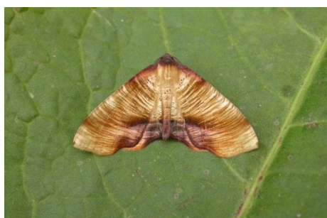
1904 Scorched Wing Plagodis dolabraria