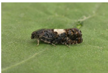
1184a Epiblema cirsiiana

1184a Epiblema cirsiiana – Tynemouth (5, 67) 20.v.2011 – TJT