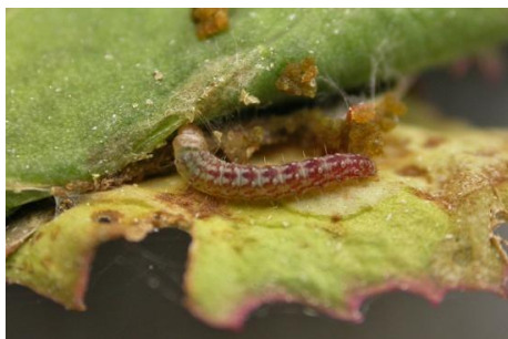
0815 Scrobipalpa nitentella

0815 Scrobipalpa nitentella – Cresswell ( 67 ) 4.viii.2011, larvae and tenanted mines – AJF