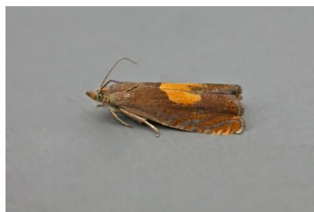
1275 Dichrorampha flavidorsana

1275 Dichrorampha flavidorsana – Alnmouth (3, 68 ) 27.vii.2011 – SMP