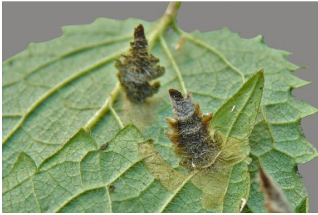
0522 Coleophora lineolea

0522 Coleophora lineolea – Acklington (3, 67) 17.ix.2011 – AJF