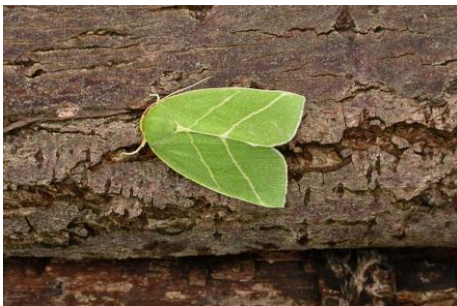
2421 Scarce Silver-lines Bena bicolorana

2421 Scarce Silver-lines Bena bicolorana – Tynemouth ( 67 ) 17.vii.2011 – TJT