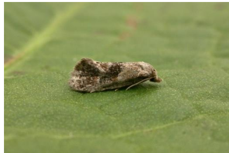
0959 Cochylidia rupicola

0959 Cochylidia rupicola – Cullernose Point (2, 68) 11.vii.2011 – AJF