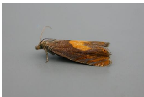
1274 Dichrorampha alpinana

1274 Dichrorampha alpinana – Whitley Bay (5, 67) 2.vii.2011 – TCS