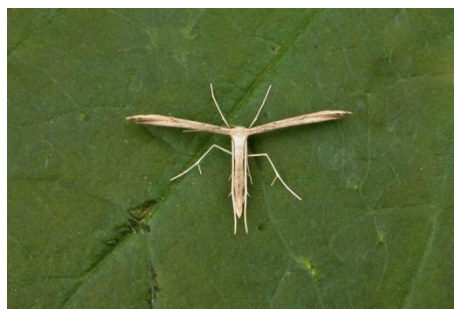
1518 Ovendenia lienigianus