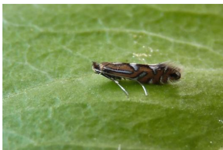
0344 Phyllonorycter strigulatella

0344 Phyllonorycter strigulatella – Swarland (5, 68 ) 18.iii.2011 – AJF