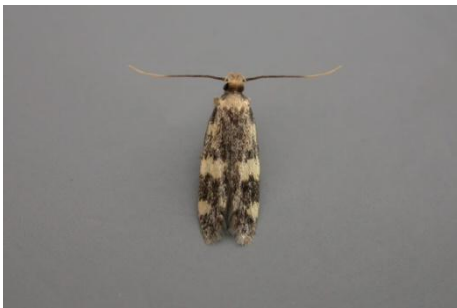
0870 Oegoconia quadripuncta

0820 Thyme Moth Scrobipalpa artemisiella – Alnmouth (4, 68) 28.vii.2011 – SMP