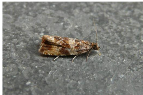
1067 Celypha cespitana