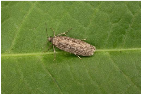
0802a Gelechia sororculella

0802a Gelechia sororculella – Gosforth Park (2, 67) 25.vii.2011 – TJT