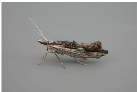
0455 Ypsolopha scabrella

0455 Ypsolopha scabrella – Swarland (141, 68 ) 17.viii.2011 – AJF