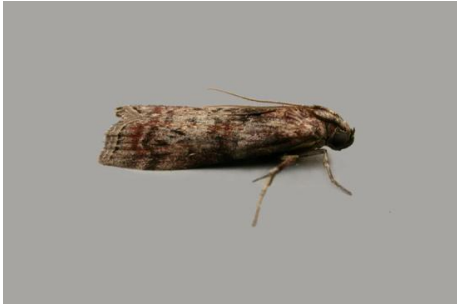
1452 Phycita roborella