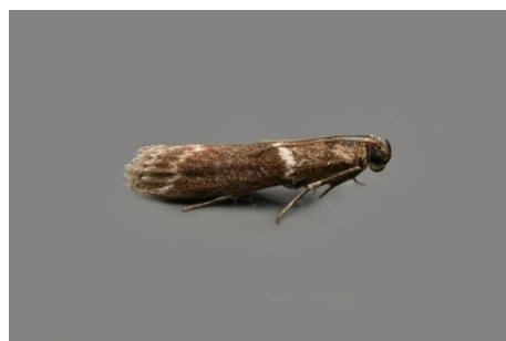
1433 Cryptoblabes bistriga