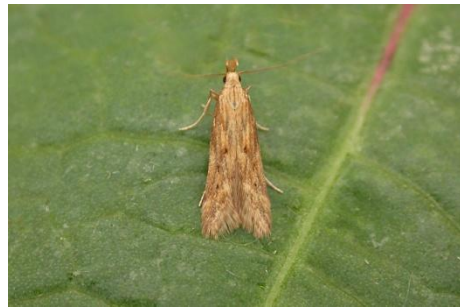
0724 Metzneria lappella

0724 Metzneria lappella – Howick (17, 68 ) 29.v.2011 – SS