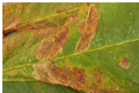
0366a Cameraria ohridella

0366a Cameraria ohridella – Morpeth (2, 67) 24.viii.2011 – AJF