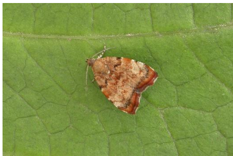
0389 Apple Leaf Skeletoniser Choreutis pariana

0389 Apple Leaf Skeletoniser Choreutis pariana – Whitley Bay (4, 67) 31.x.2011 – N & MT