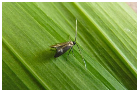
0153 Adela fibulella