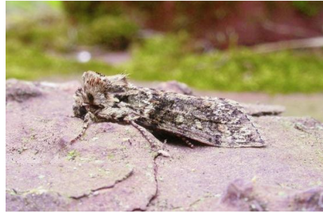
1660 Frosted Green Polyploca ridens

1660 Frosted Green Polyploca ridens – Lambley ( 67 ) 22.iv.2011 – DF