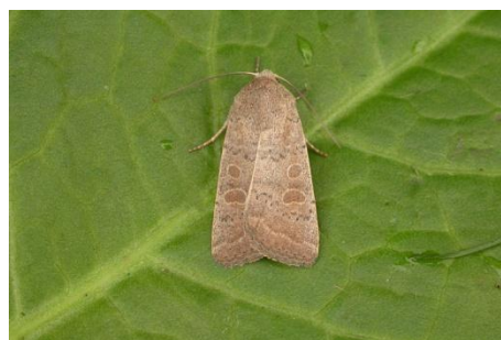
2384 Vine's Rustic Hoplodrina ambigua

2384 Vine's Rustic Hoplodrina ambigua – Tynemouth (5, 67) 6.ix.2011 – TJT