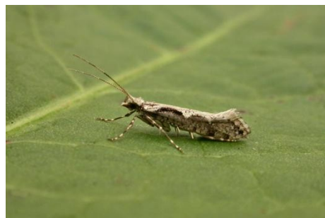
0467 Rhigognostis annulatella