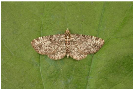
1859 Sloe Pug Pasiphila chloerata

1859 Sloe Pug Pasiphila chloerata – Swarland ( 67 ) 21.vi.2011 – AJF