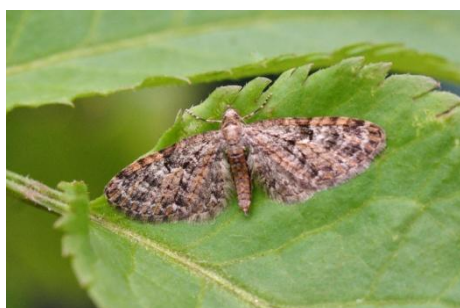
1853 Oak-tree Pug Eupithecia dodoneata