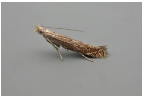
0729 Isophrictis striatella

0729 Isophrictis striatella – Whitley Bay (3, 67) 2.viii.2011 – N & MT