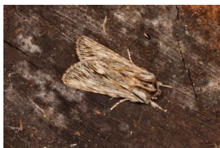
2227 Sprawler Asteroscopus sphinx