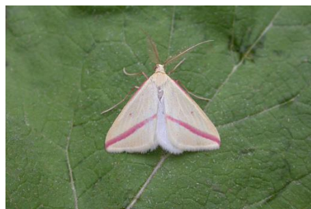
1716 Vestal Rhodometra sacraria

1716 Vestal Rhodometra sacraria – Kielder IV: RIS Site 637 (67) singles on 2 & 3.x.2011 – DK, Brownsman, Farne Islands (68) 3.x.2011 – DS