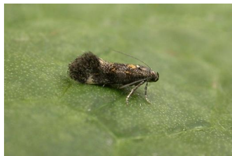
0747 Chrysoesthia sexguttella