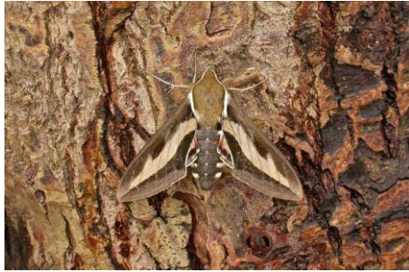
1987 Bedstraw Hawkmoth Hyles gallii