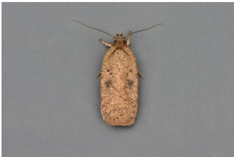
0704 Agonopterix scopariella

0704 Agonopterix scopariella – Tynemouth (4, 67) 5.iv.2011 – TJT