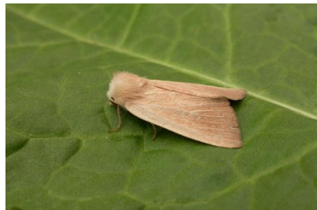
2377 Fen Wainscot Arenostola phragmitidis

2377 Fen Wainscot Arenostola phragmitidis – Tynemouth ( 67 ) 3.viii.2011 – TJT