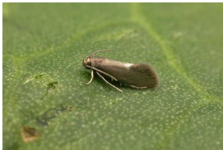
0154 Heliozela sericiella

0154 Heliozela sericiella – Gosforth Park (3, 67) 19.iv.2011 – TJT & TCS