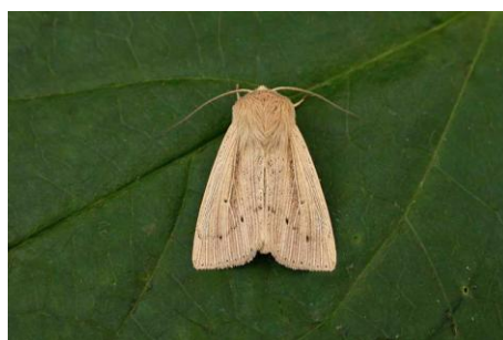
2197 Southern Wainscot Mythimna straminea