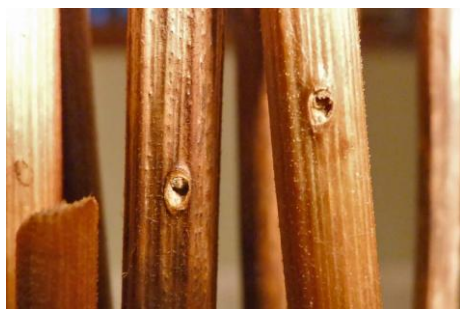
1517 Adaina microdactyla