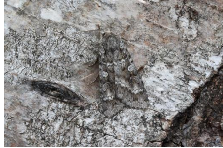
2137 Great Brocade Eurois occulta

2137 Great Brocade Eurois occulta – Tynemouth (67) 22.vii.2011 – TJT, Howick (68) 24.vii.2011 – SS