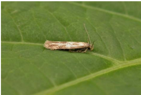
0893 Mompha epilobiella

0893 Mompha epilobiella – Whitley Bay (4, 67) 29.v.2011 – TCS