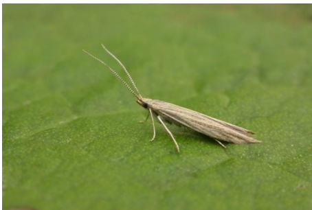
0565 Coleophora saxicolella

0565 Coleophora saxicolella – Alnmouth ( 68 ) 27.vii.2011, genitalia det. – SMP