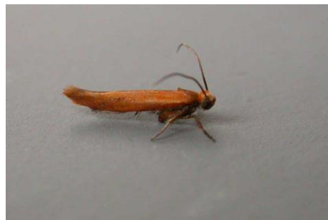
0435 Zelleria hepariella

0435 Zelleria hepariella – Monkseaton (3, 67) 31.vii.2011 – MSH