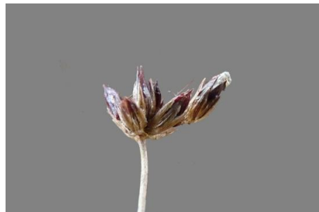
0581 Coleophora taeniipennella

0581 Coleophora taeniipennella – Druridge Pools ( 67 ) 22.xi.2011, cases on Jointed Rush – AJF